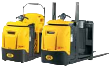
XLOGO ac – XOP 0.7 ac

Choose OM means get a strong partner who can give you the right solution