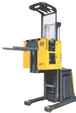
XOP2 ac – XOP3 ac

Vertical order pickers XOP1 series are strong and compact, ideal for picking height till 3700mm. Available with fixed forks, FEM forks (in conjunction with auxiliary lift) and with different platform heights. According to version, XOP1 trucks could be standard equipped with overhead guard and lateral barriers.